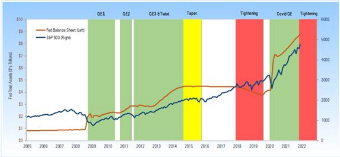
QE Helped Drive Stock Returns & Suppressed Volatility